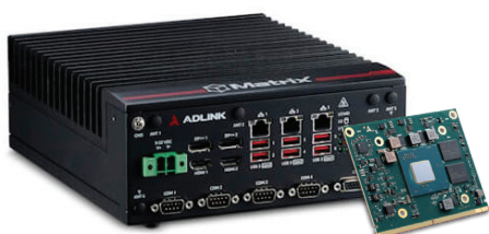
Figure 2. The ADLINK MVP-5200-MXM computer and MXM-AXe GPU module.

Hyper Compute, which is part of Intel Deep Link technology, intelligently balances compute workloads across CPU and GPU resources. This underlying mechanism enables applications to harness availability and maximize utilization of Intel hardware capabilities to speed up computations. Similarly, the Intel® OpenVINO™ inference engine is capable of combining CPU, integrated GPU, and discrete GPU resources available on an Intel platform such as the ADLINK MVP-5200 series computer to support AI workloads. The OpenVINO solution stack features an open, non-proprietary programming model and draws on the unmatched Intel ecosystem of hardware and software building blocks.